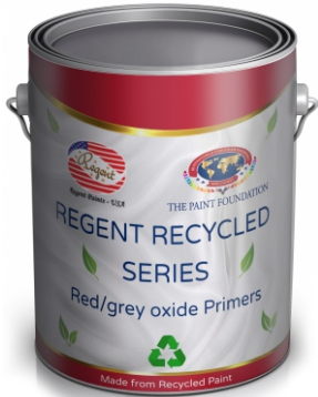
Red/Grey Oxide Primers