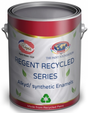
Alkyd/ Synthetic Enamels