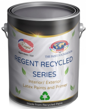
Interior / Exterior Latex Paints and Primer